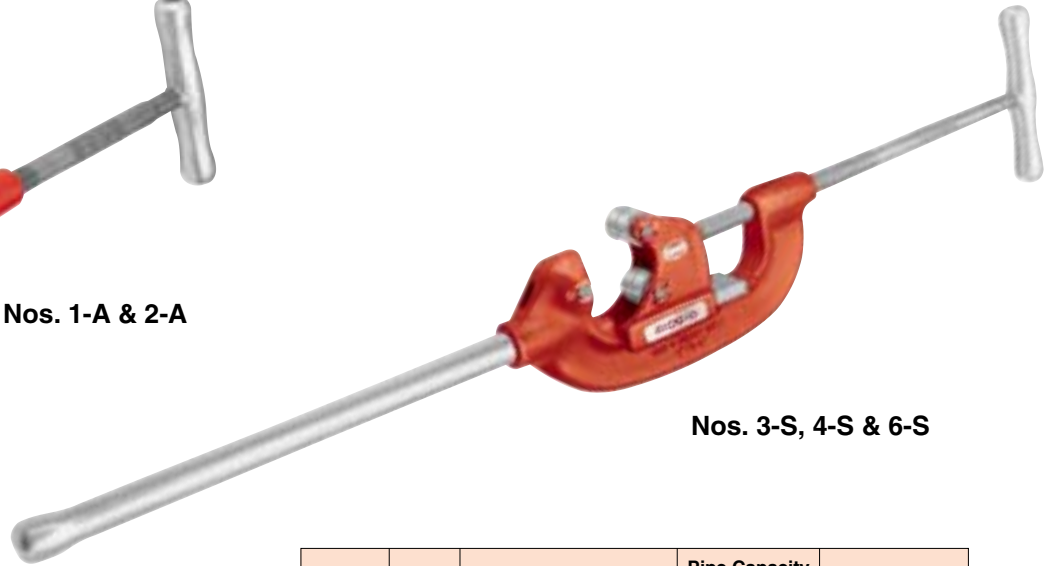
Nos. 3-S, 4-S & 6-S